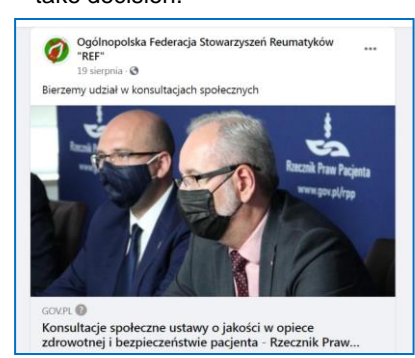
Public consultations on new law of quality in healthcare and patient's safety with Minister of Health (right) and Minister for Patients' Rights

Webinars, helpline, links to publication give answers for those questions or help to understand new situation and take decision.