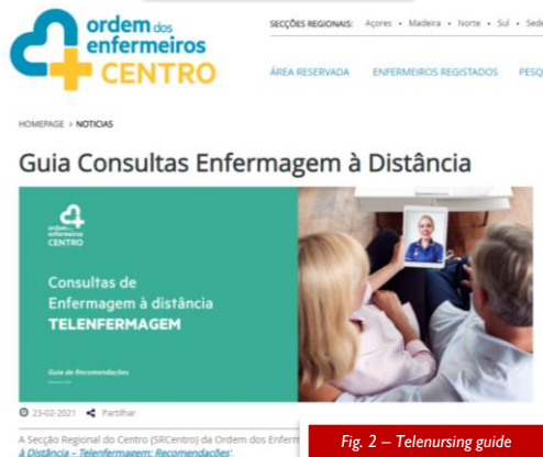
Fig. 2 – Telenursing guide